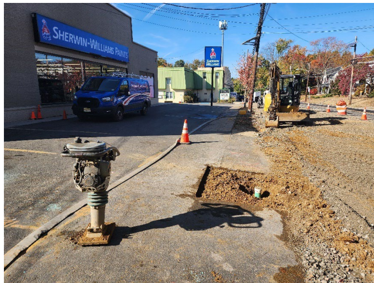
Figure 3: Began replacement of sewer laterals along the EB lane.