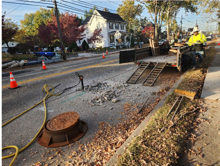
Figure 2: Continued replacement of manhole castings and covers at various locations.

Department of Public Works Charles J. DePalma Complex 2311 Egg Harbor Road Lindenwold, NJ 08021 phone 856.566.2980 fax 856.566.2988 highway@camdencounty.com CamdenCounty.com