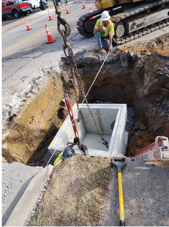
Figure 4: Installation of new drainage inlet near the intersection of Market and Kings Hwy.