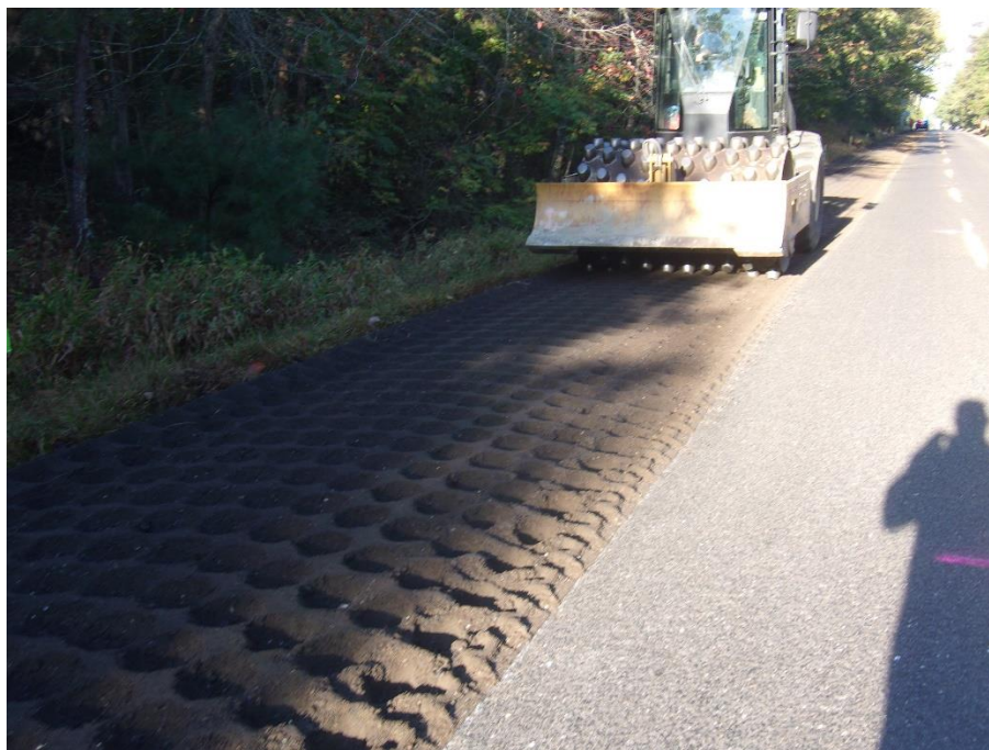
Figure 3 Sheepfoot Roller Trailing Reclaimer