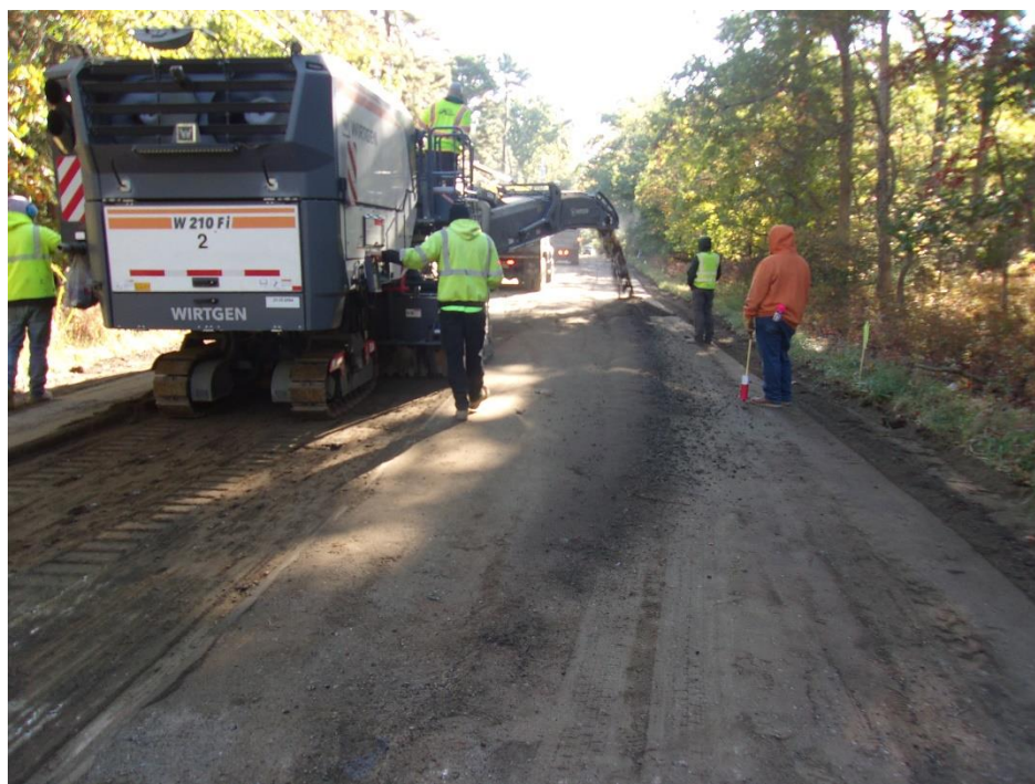
Figure 6 Contractor checks grades along Chew Road, Mill utilized in Fill areas