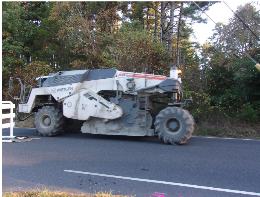
Figure 2 Full Depth Reclamation starts at STA 12+50±