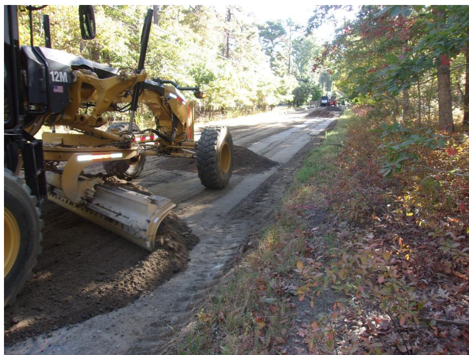
Figure 7 Grader sets proposed grade over cut/fill areas