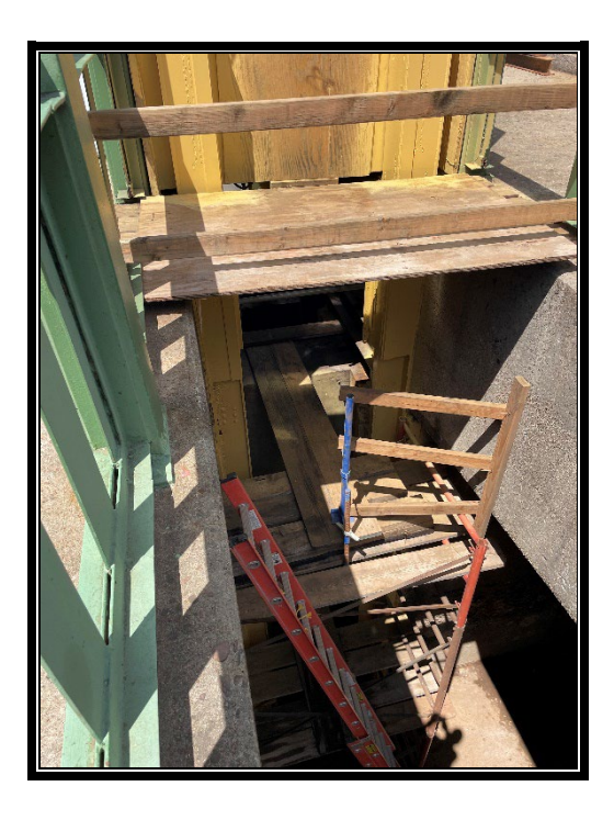
Figure 3: Primer applied to lifting structure.