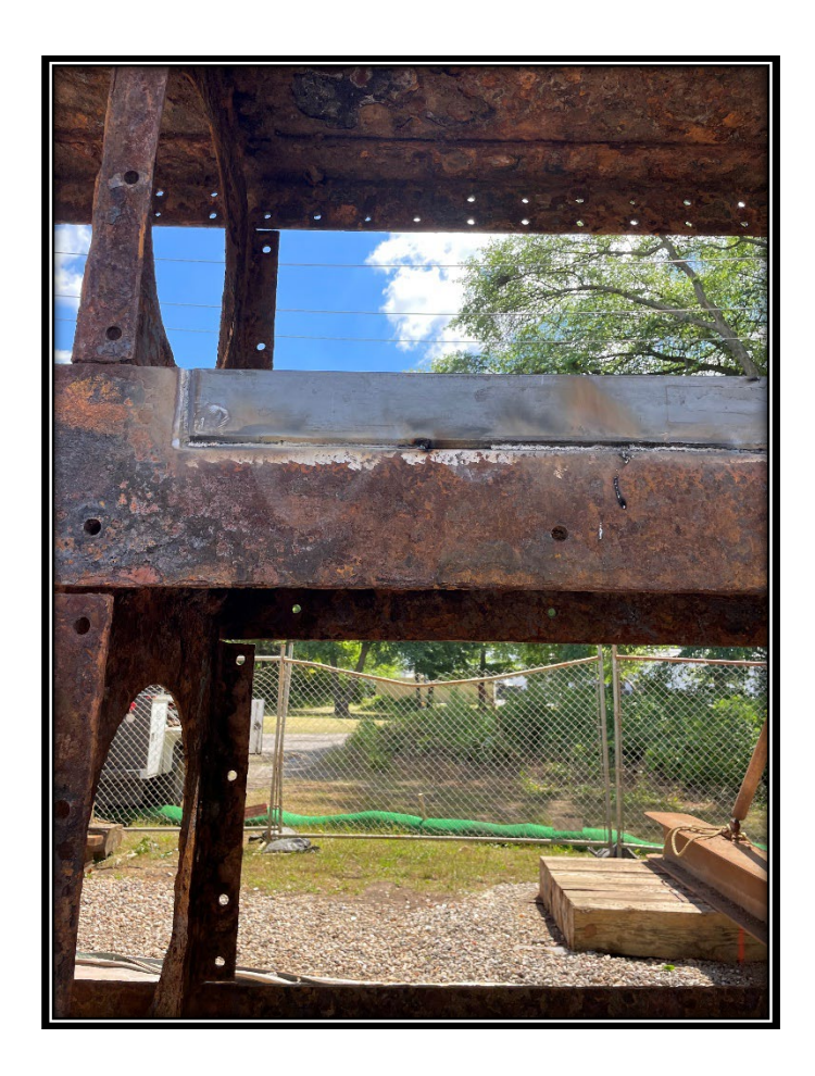
Figure: l Additional repair area on East Tide Gate.

Progress Report #5 Monday, June 24, 2024 to Friday, July 5, 2024