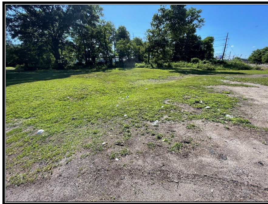
Figure 3: Driscoll Construction selected staging area on east side of North Park Drive.