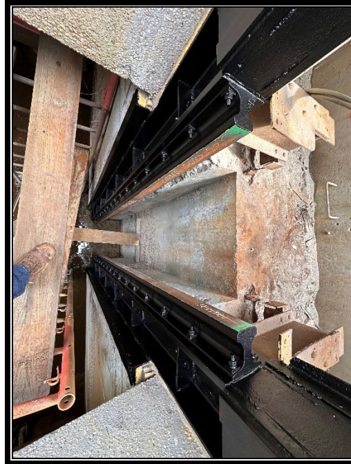
Figure 2: New Crane Rails With Stiffeners.

Department of Public Works Charles J. DePalma Complex 2311 Egg Harbor Road Lindenwold, NJ 08021 phone 856.566.2980 fax 856.566.2988 highway@camdencounty.com CamdenCounty.com