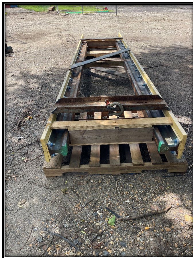
Figure:1 New Crane Rails.

Monday, August 19, 2024, to Friday, August 30, 2024