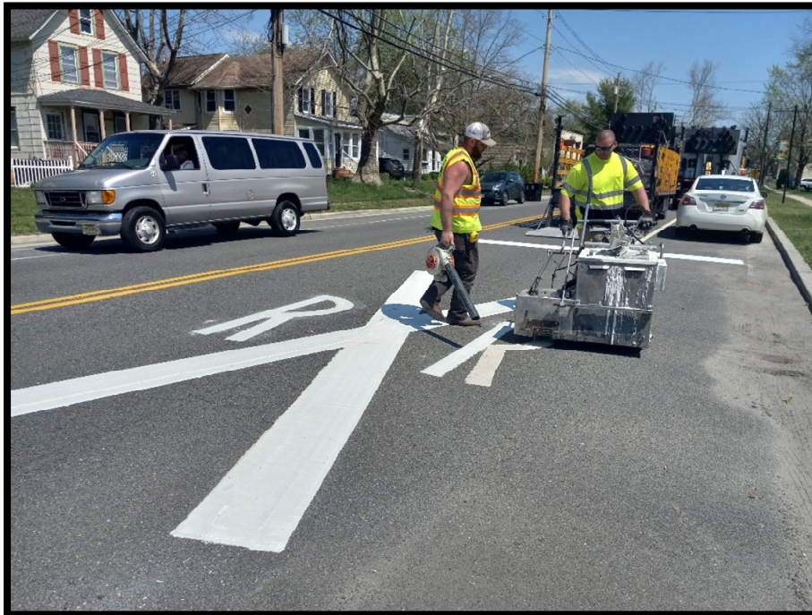
Photograph 3 – Typical Railroad Crossing symbols being installed on Atco Avenue (CR 710).