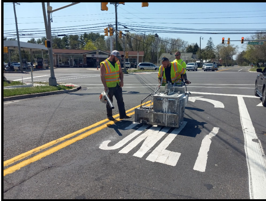
Photograph 4 – Typical “ONLY” and Lane Turn Arrows being installed on Atco Avenue (CR 710 near the White Horse Pike.