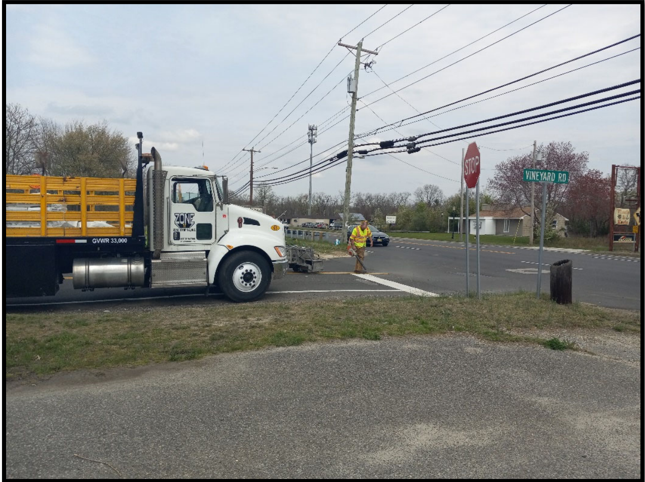
Photograph 1 – 24" White Thermoplastic Stop Bar being installed by Zone Striping on Vineyard Road (CR 719) at the intersection with the White Horse Pike in Waterford Township.