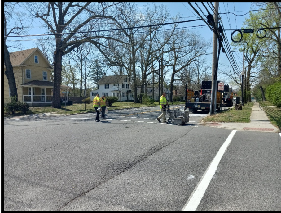
Photograph 2 – Typical Standard Crosswalk being installed at the Atco Avenue (CR 710) intersection with Carl Hasselman Drive.