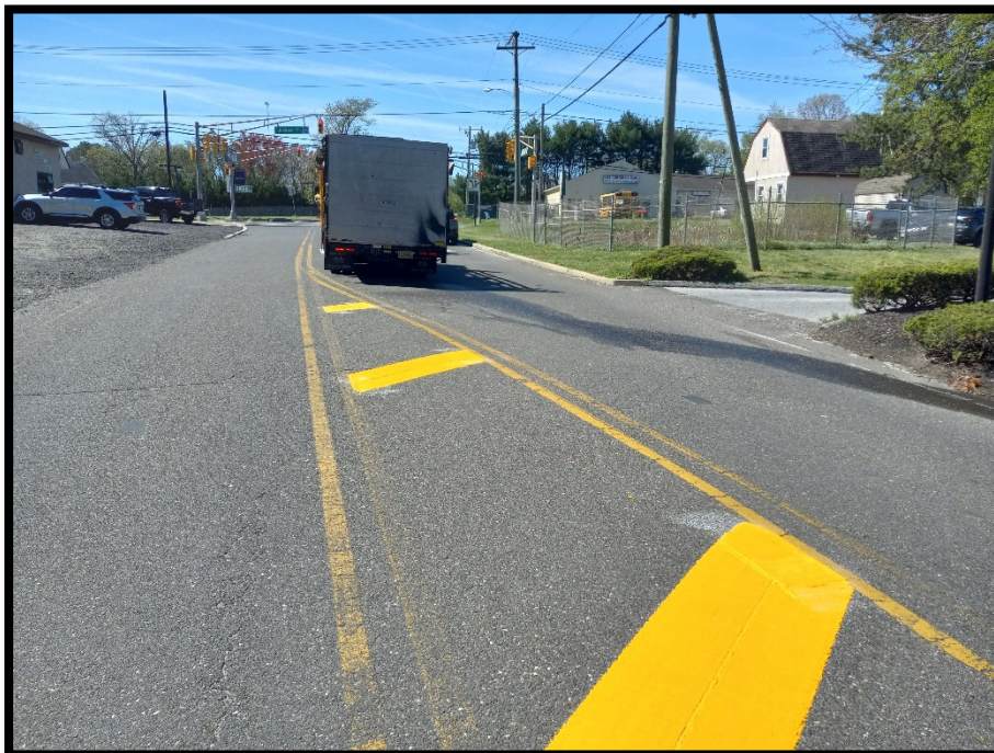
Photograph 5 – Typical Yellow Gore Striping installed on Cooper Road (CR 713).