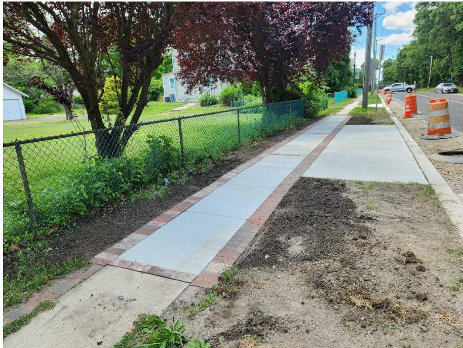
Figure 1. Sidewalk Replacement on Berlin Rd.