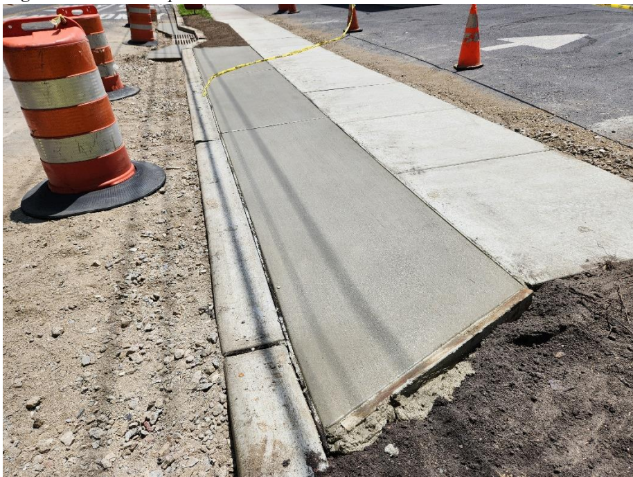
Figure 2. Concrete apron, sidewalk, curb, and gutter