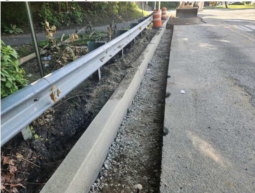
Figure 2. Curb Berlin Road to Gibbsboro Road.