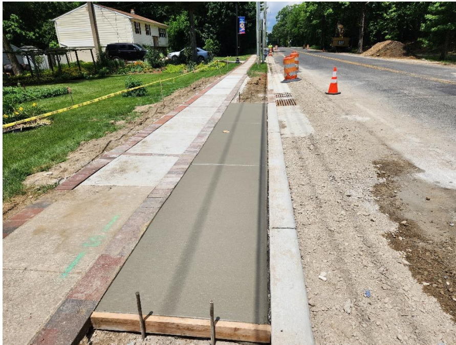
Figure 1. Concrete Bus pad placement on Berlin Rd.