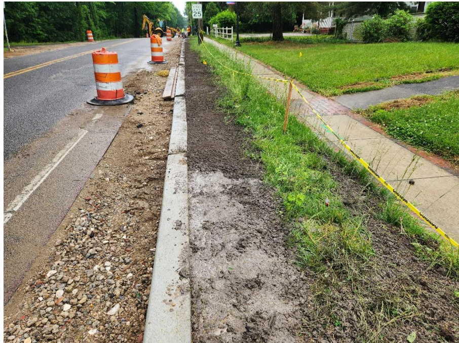
Figure 2. Some turf restoration/topsoil placed behind the new curbs