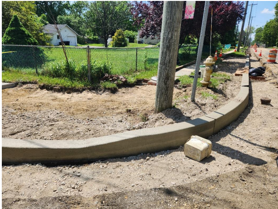
Figure 1. Concrete curb placement on Berlin Rd.