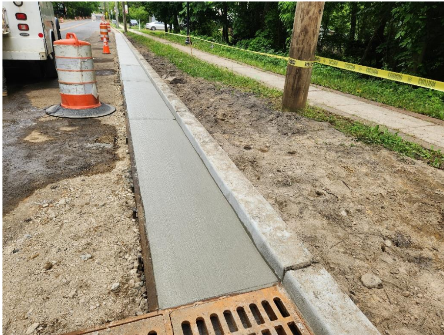
Figure 1. Concrete curb and gutter placement on Berlin Rd.