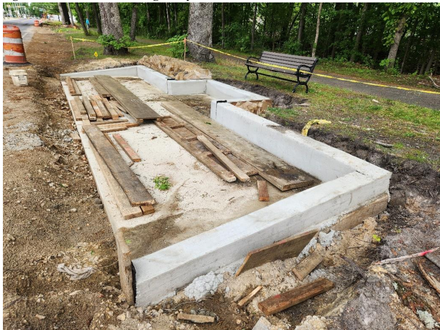
Figure 2. Header curb for Myrtle Avenue bus pad (in progress).