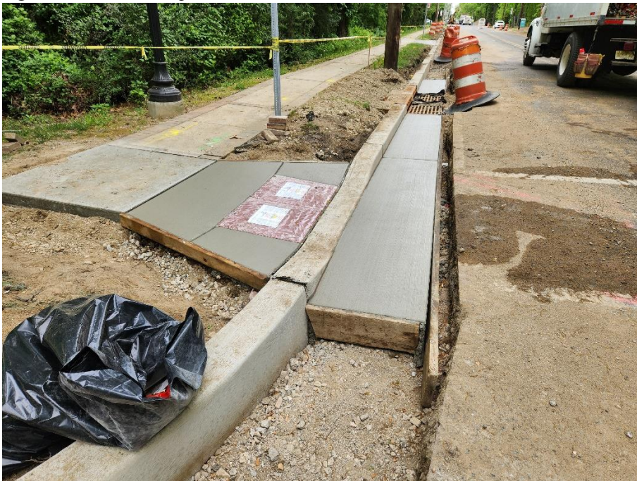
Figure 2. Concrete placement for an ADA curb ramp and gutter.