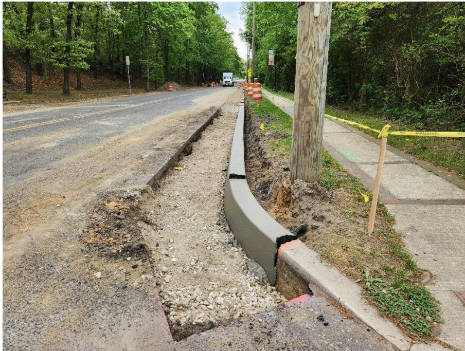
Figure 1. Concrete curb placement on Berlin Rd.