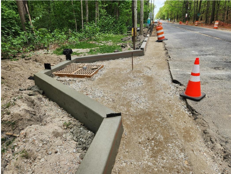
Figure 1. Concrete curb installation.