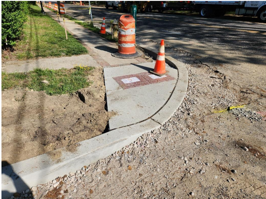
Figure 2. A recently installed ADA curb ramp.