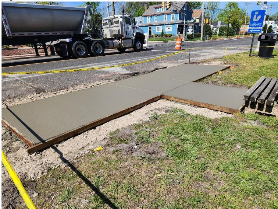
Figure 2. Concrete pad for bench at Linden and Berlin Rd.