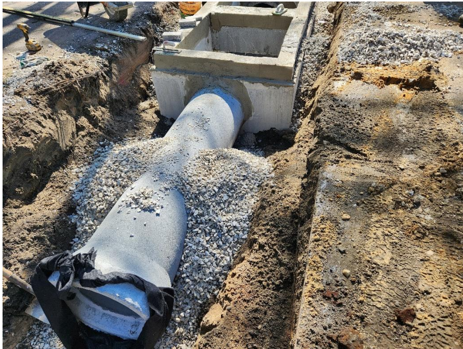
Figure 1. Inlet installation on Berlin Rd.