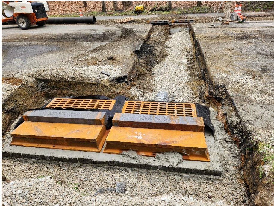
Figure 1. Inlet installation on Berlin Rd.