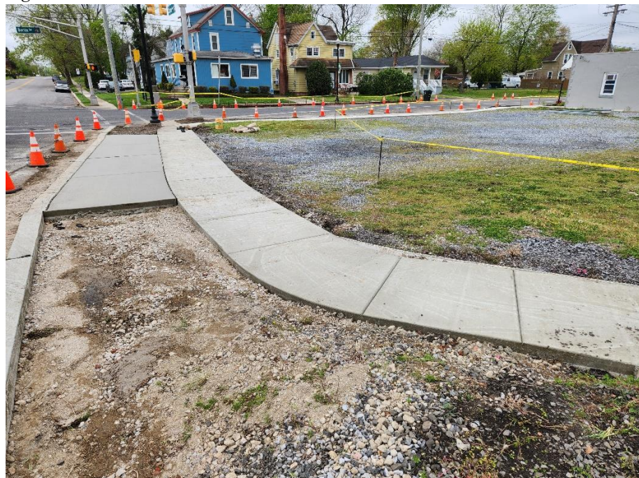
Figure 2. Sidewalk and Curb build at Linden and Berlin Intersection.