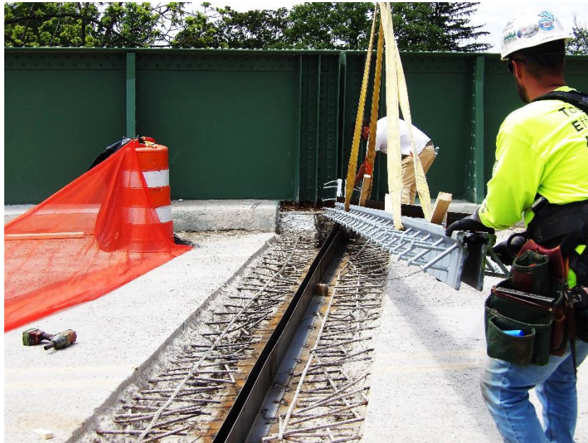
Workers set the center pier deck joint steel rails

Bi-Weekly Progress Report No. 6 5-13-2024 through 5-24-2024