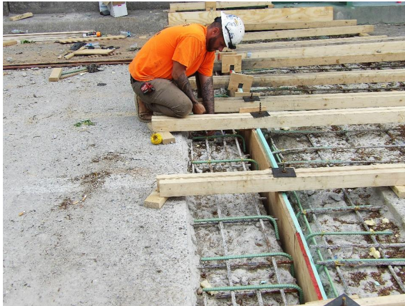
Workers formed the north abutment deck joint