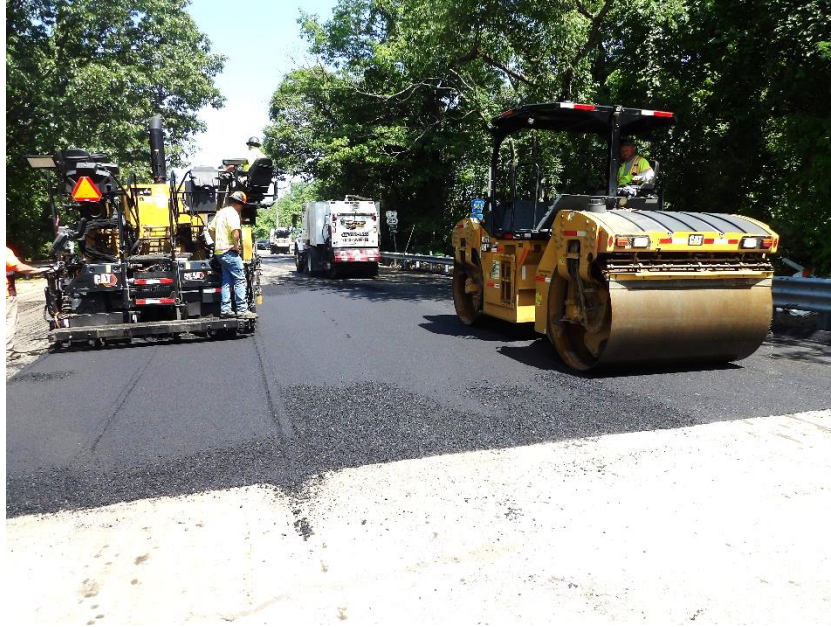
Approach paving was completed and finish rolled