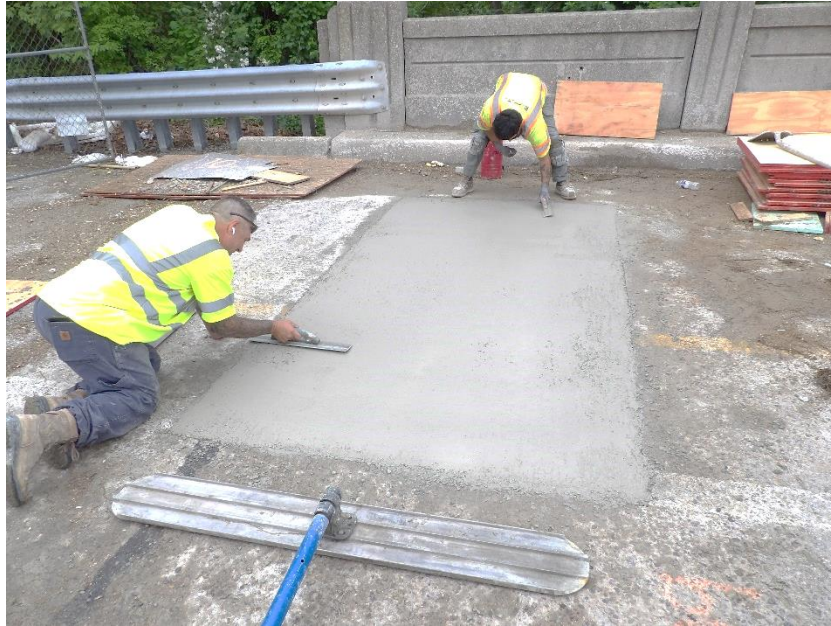
Workers prepped and poured all remaining concrete deck and curb patches