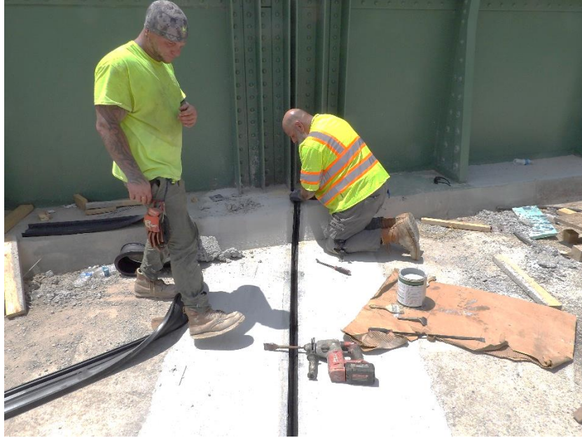
Workers installed the deck joint neoprene seals