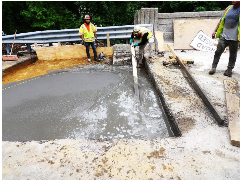
The approach roadway undermining was repaired with flowable concrete fill