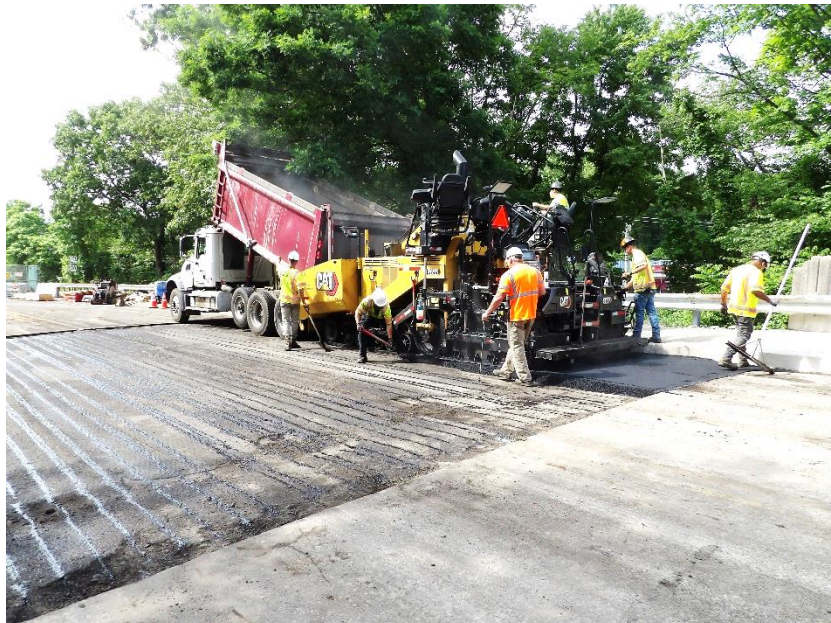
Workers paved the approach roadways