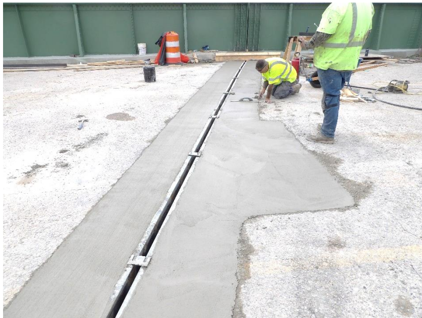
The center pier deck joint was completed