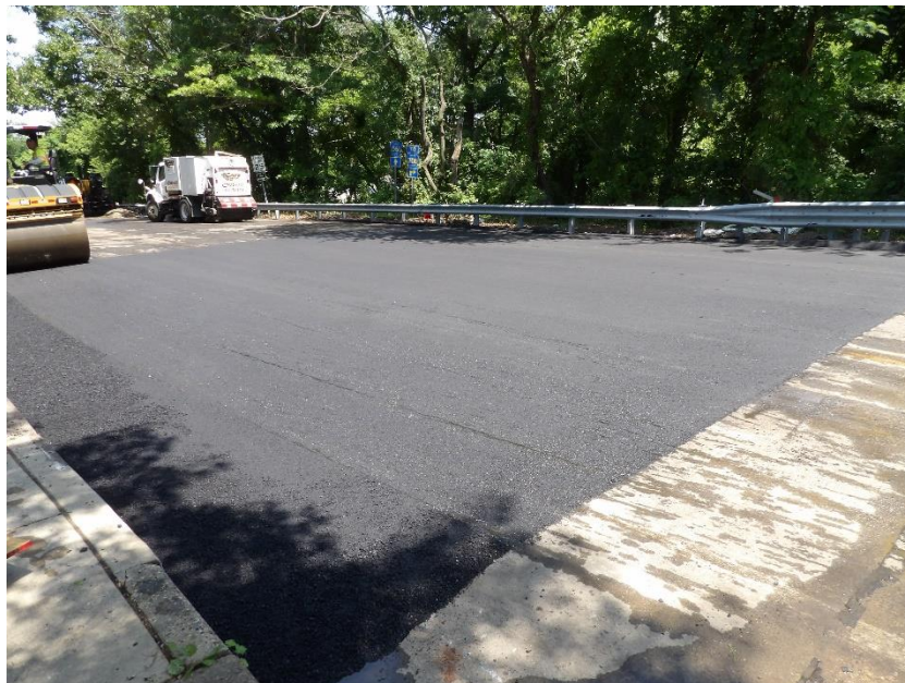
North and south approach roadway paving was completed