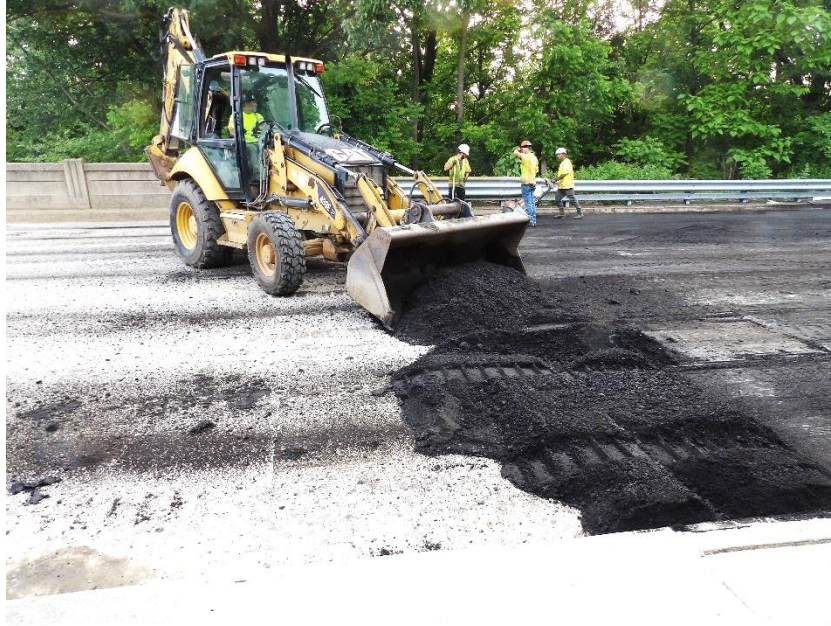
The approach roadways were milled and cleaned