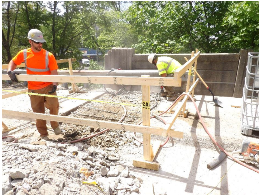
Workers removed deteriorated concrete from the remaining deck patch areas