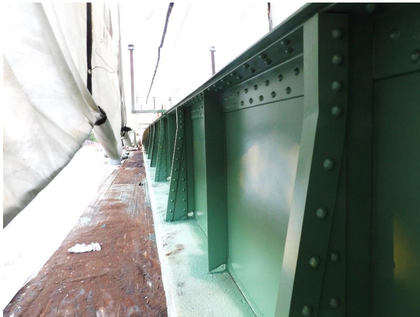
Painters applied the finish coat to the steel girders