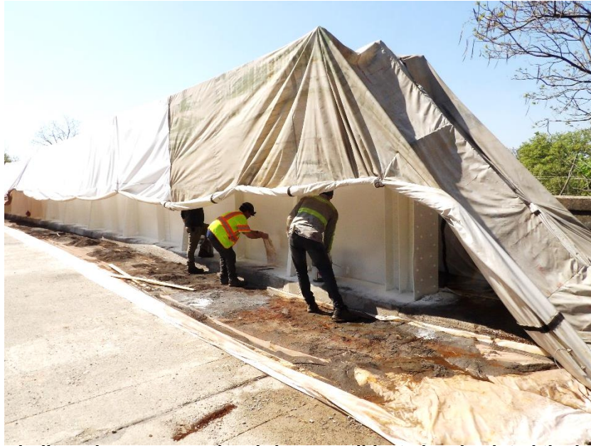
Painters built enclosures over the girders, sandblasted and painted the base coat