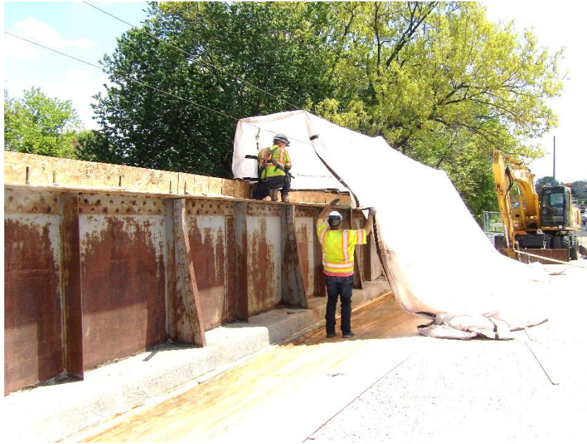
Painters moved the enclosure to the east girder and blasted and painted the steel