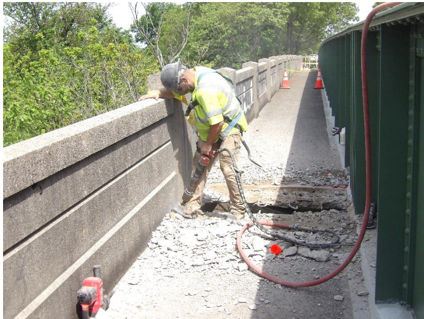
Workers began and completed demolition of the existing sidewalk joints