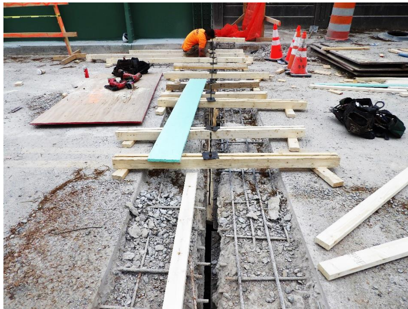
Work at the north abutment deck joint is in progress