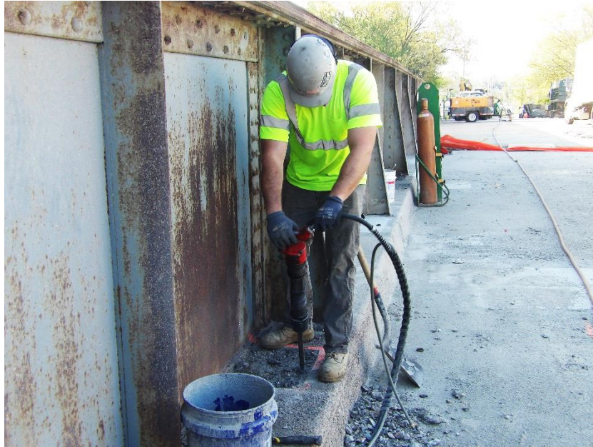
Workers continued to remove deteriorated curb sections