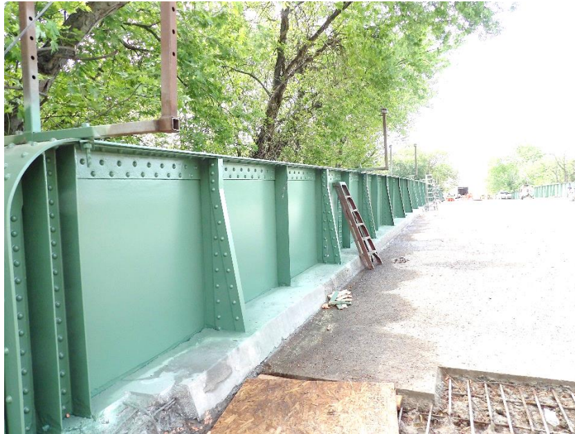
Roadway girder painting was completed