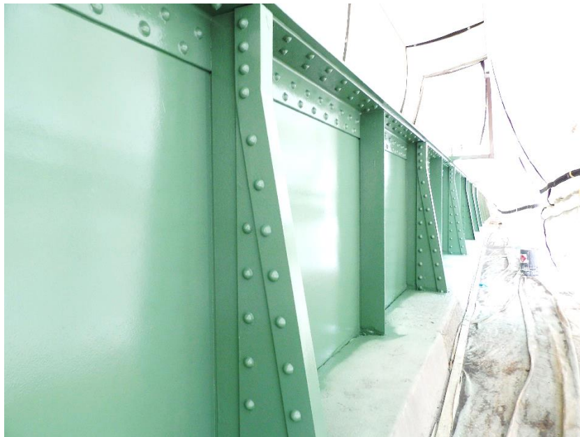
Painters completed painting the east girder