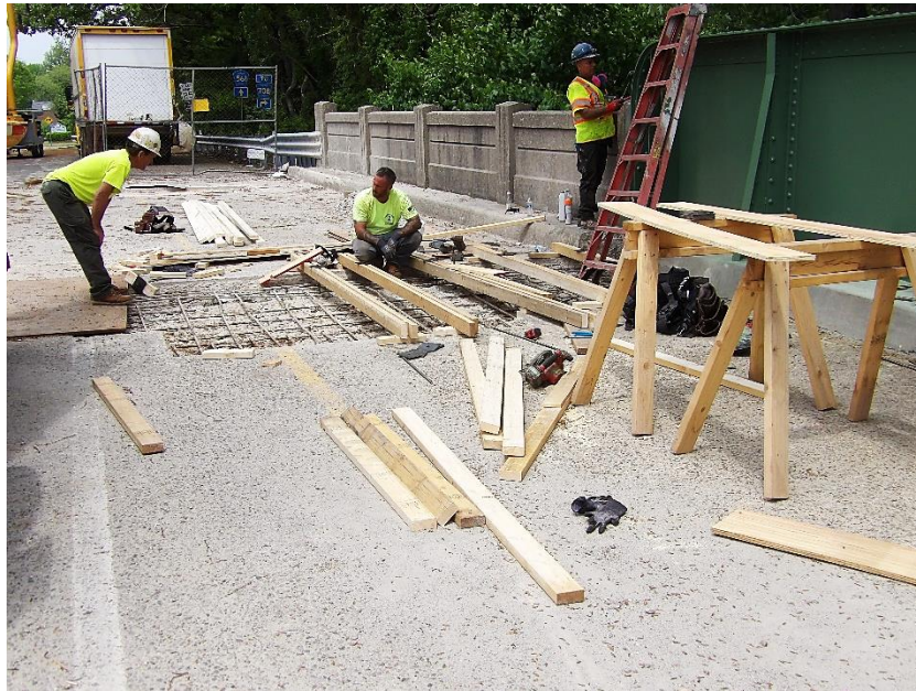
Workers set up and began forming the north abutment deck joint