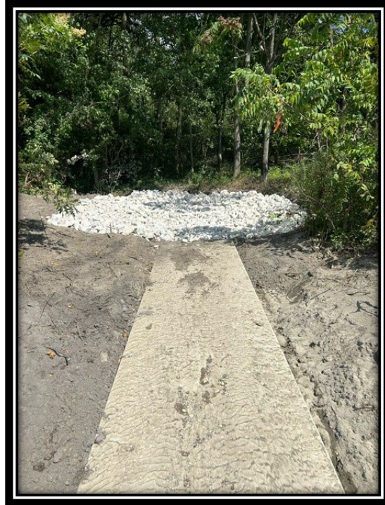
Figure: 2 – Installation of scour hole at the end of the newly installed concrete drainage swale along the frontage of 117 Jackson Road