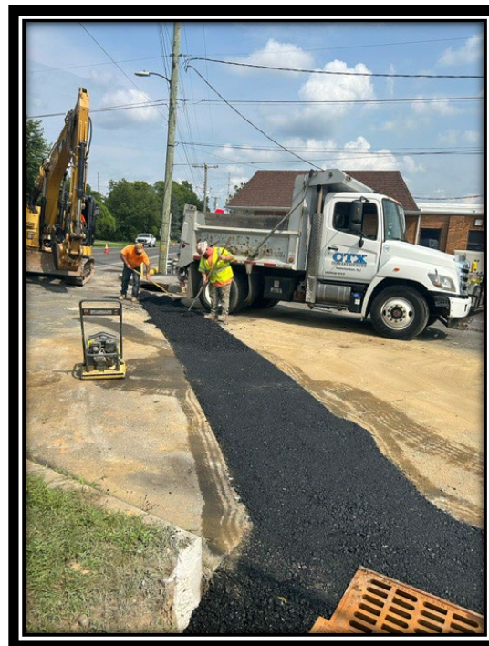
Figure: 3 – HMA trench restoration over newly installed 12" RCP at the intersection with Washington Street