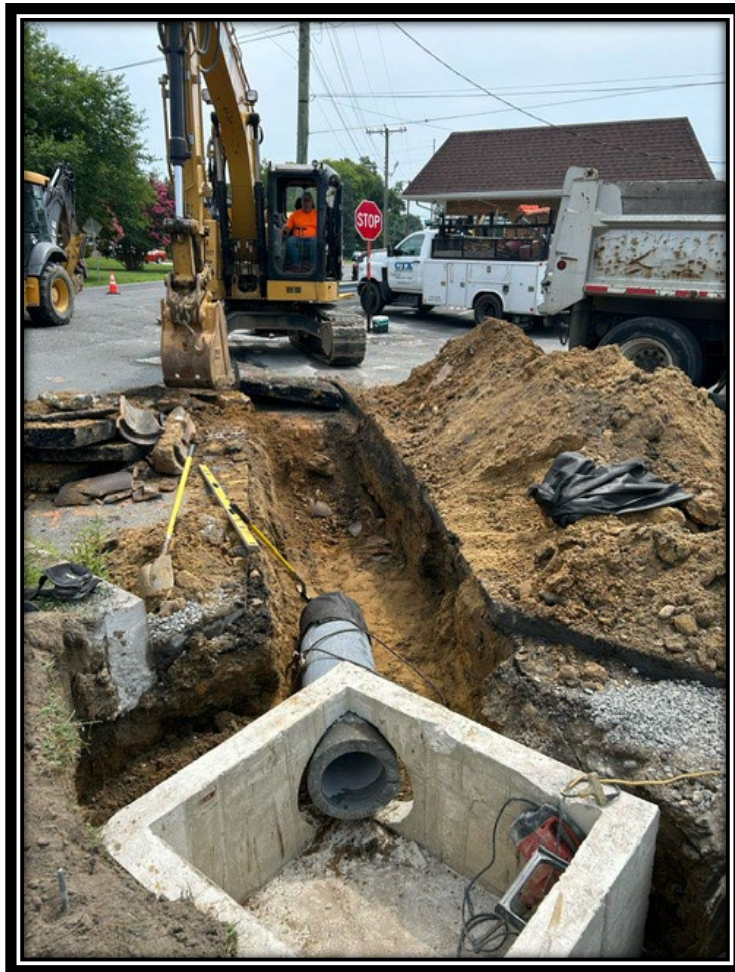
Figure: 1 – Installation of Type B Inlet and 12” RCP at the intersection with Washington Street