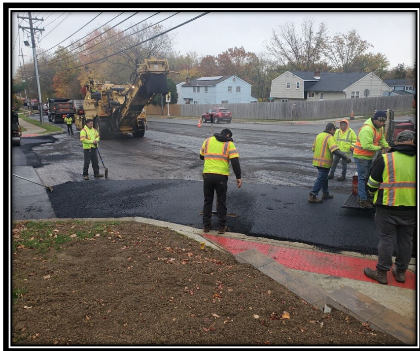
Figure: 3 – Installation of HMA 12.5M64 surface course in the westbound lane between the County Border and King’s Highway