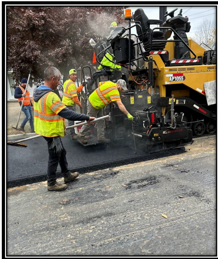
Figure: 1 – Installation of HMA 19M64 base course in the westbound lane between Columbia Boulevard and Plum Court

BI-WEEKLY PROGRESS REPORT #25 October 30, 2023 to November 10, 2023