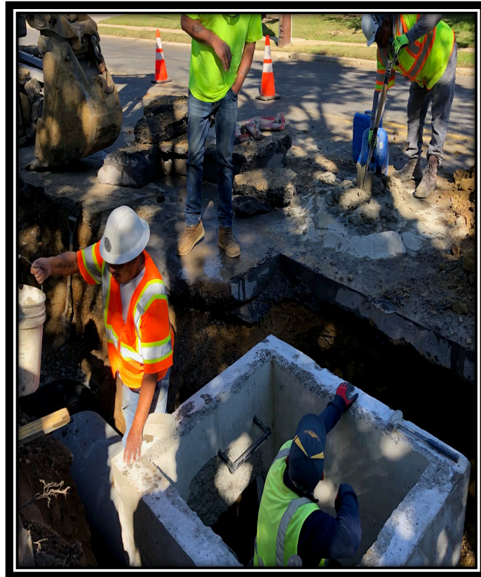
Figure: 3 – Installation of Type ' B ' inlet at the intersection with Oak Avenue