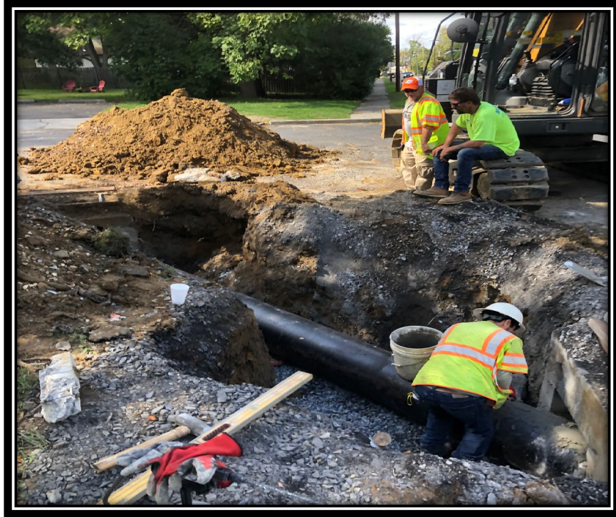
Figure: 2 – Installation of 16" DIP at the intersection with Washington Avenue