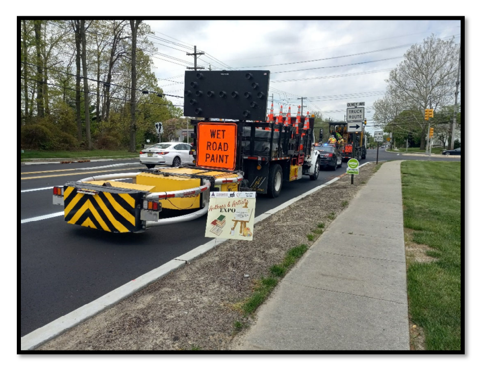
Photograph 6 – Subcontractor installing traffic striping and markings.