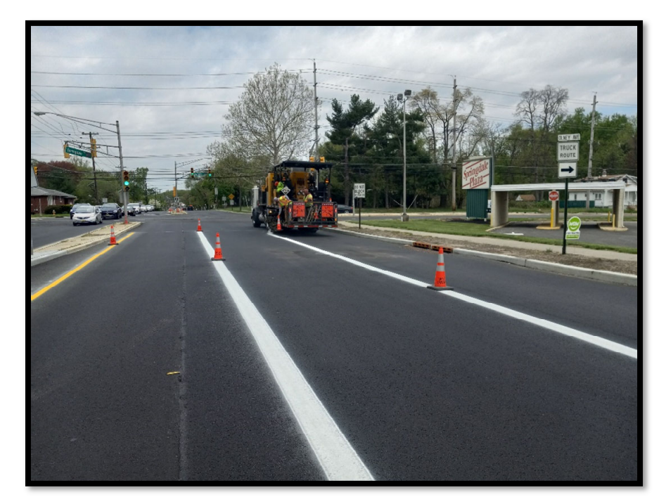
Photograph 7 – Subcontractor installing traffic striping and markings.

Department of Public Works Charles J. DePalma Complex 23ll Egg Harbor Road Lindenwold, NJ 0802l Phone 856.566.2980 Fax 856.566.2988 highway@camdencounty.com CamdenCounty.com