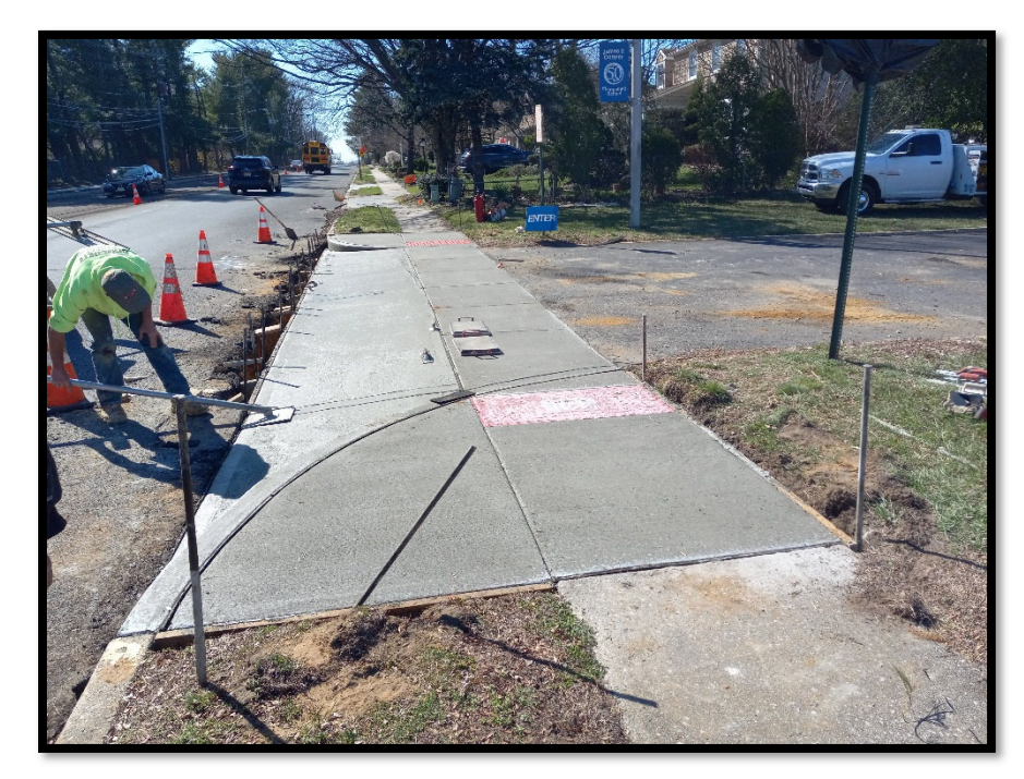
Photograph 5 – Concrete apron being installed in front of Cooper Elementary School.

Department of Public Works Charles J. DePalma Complex 23ll Egg Harbor Road Lindenwold, NJ 0802l Phone 856.566.2980 Fax 856.566.2988 highway@camdencounty.com CamdenCounty.com