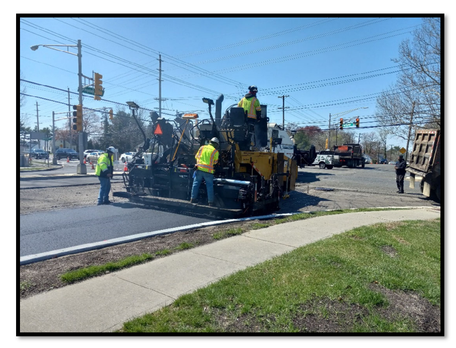
Photograph 6 – Hot Mix Asphalt Surface Course being installed near Springdale Road.

Department of Public Works Charles J. DePalma Complex 23ll Egg Harbor Road Lindenwold, NJ 0802l Phone 856.566.2980 Fax 856.566.2988 highway@camdencounty.com CamdenCounty.com