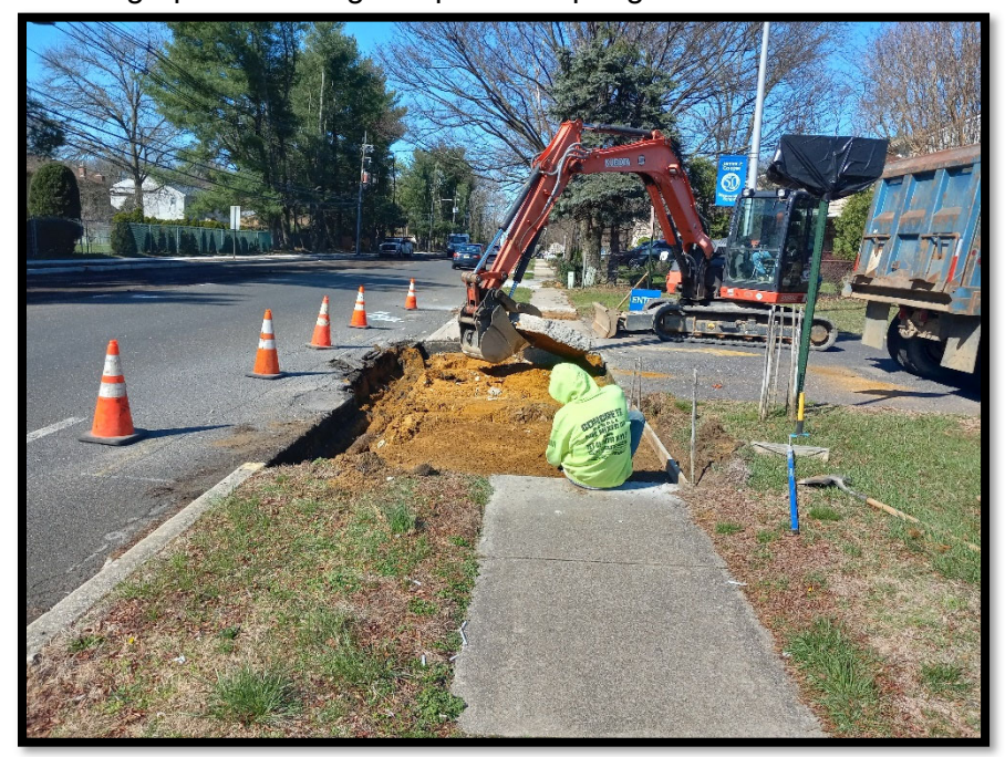
Photograph 4 – Concrete apron being being replaced in front of Cooper Elementary School.