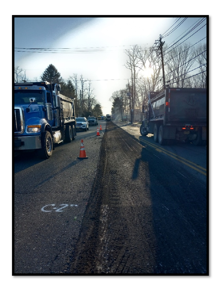
Photograph 1 – First pass with milling machine.