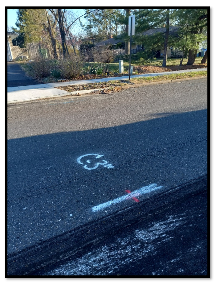
Photograph 2 – Area of mill with 3" cut.