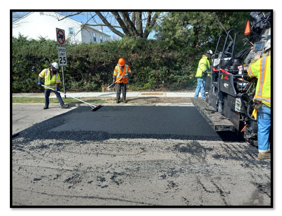
Photograph 6 – Hot Mix Asphalt Surface Course being installed.