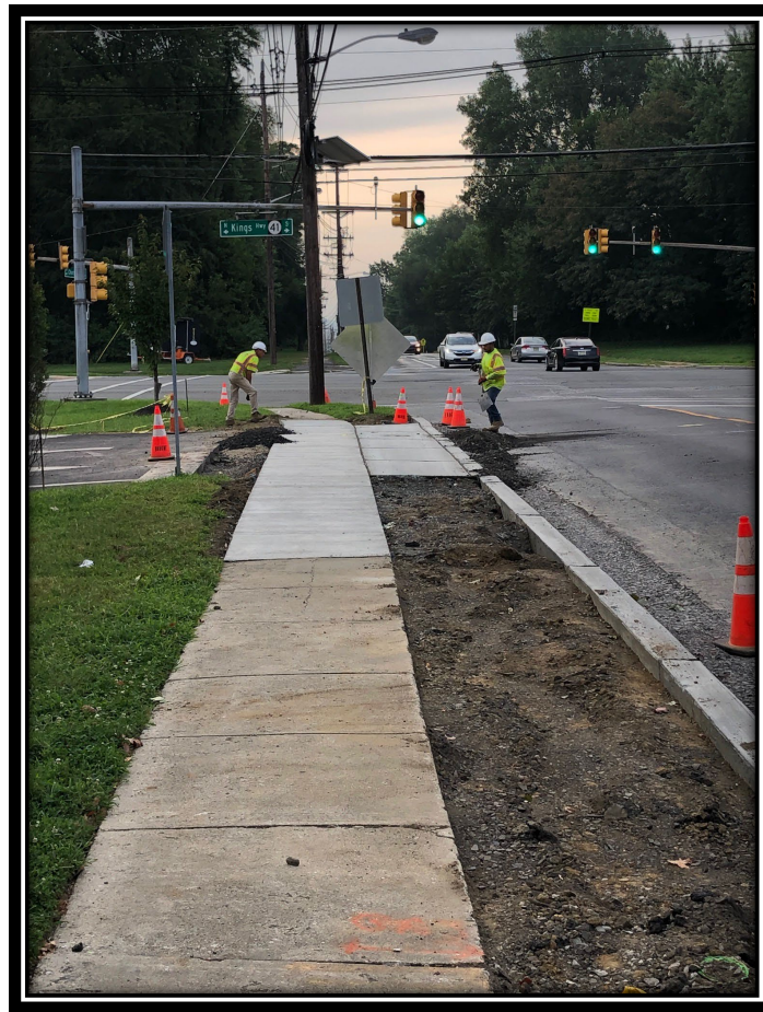
Figure: 1 – Installation of reinforced concrete driveway apron, sidewalk and curb along the westbound lane between King's Highway and Friendship Drive