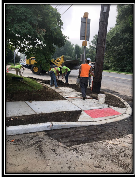
Figure: 2 – Topsoil, seed and fertilizer restoration around newly installed ADA ramp and concrete sidewalk along the westbound lane at the intersection with Crofton Commons