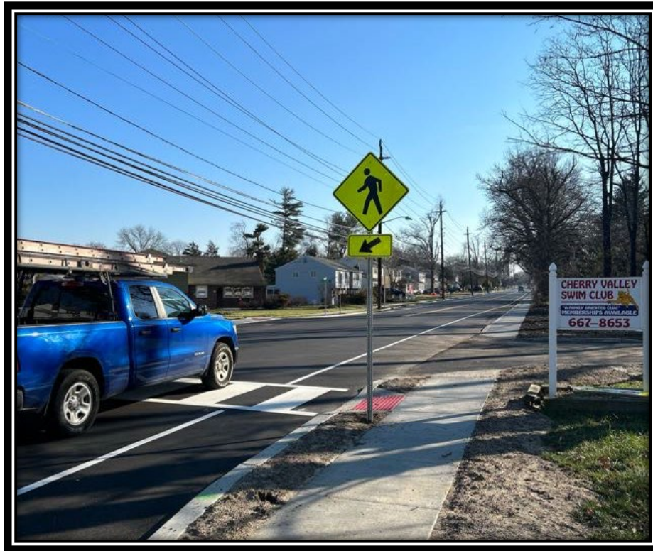
Figure: 2 – Installation of pedestrian crossing sign at the entrance to the Cherry Valley Swim Club