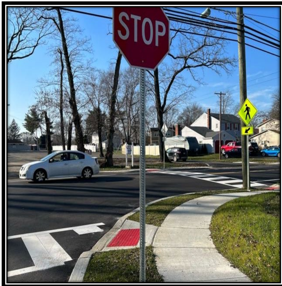
Figure: 1 – Installation of stop sign and pedestrian crossing sign at the intersection with Millstream Drive

BI-WEEKLY PROGRESS REPORT #29 December 25, 2023 to January 5, 2024