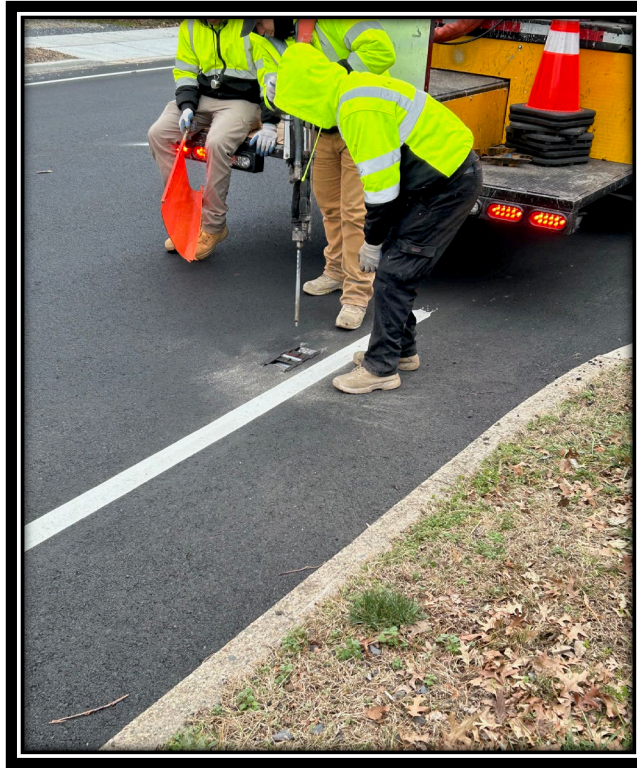
Figure: 2 – Installation of mono-directional white lens raised pavement marking (RPM) along the westbound lane between King’s Highway and Millstream Drive