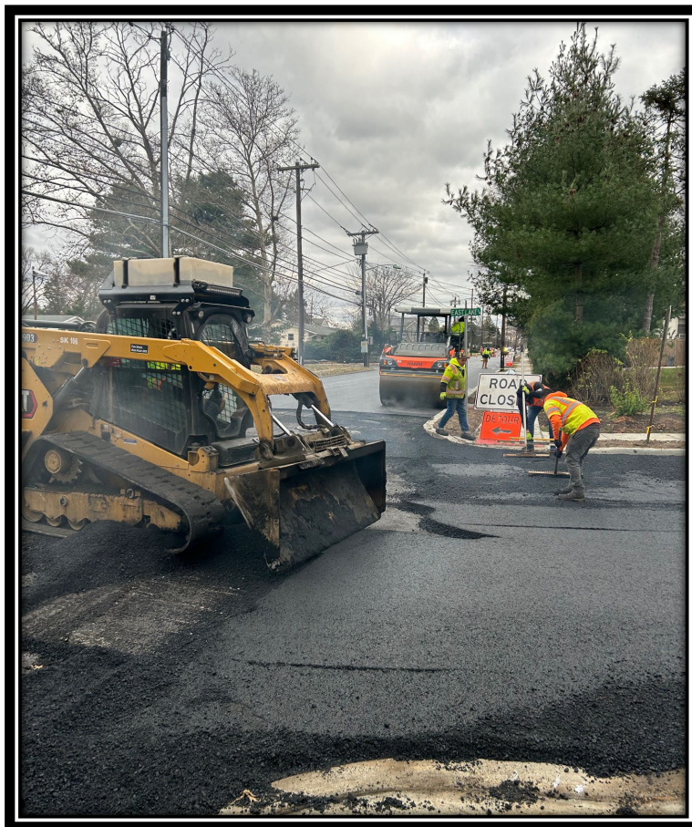
Figure: 1 – Installation of HMA 12.5M64 surface course at the intersection with East Lake Drive

BI-WEEKLY PROGRESS REPORT #28 December 11, 2023 to December 22, 2023