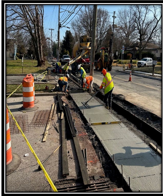
Figure: 2 – Installation of concrete curb, sidewalk, and driveway apron along the westbound lane between Oak Avenue and Rt. 38