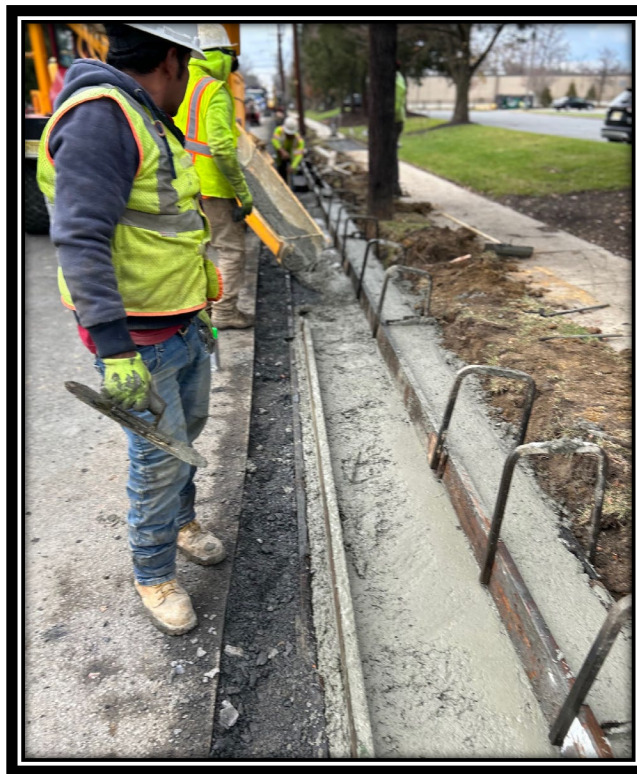
Figure: 3 – Installation of concrete monolithic curb and gutter along the westbound lane between Oak Avenue and Rt. 38