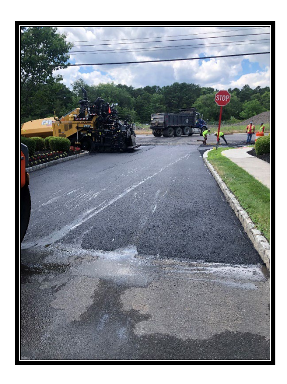
Figure 3: P&A Construction paves HMA surface course.