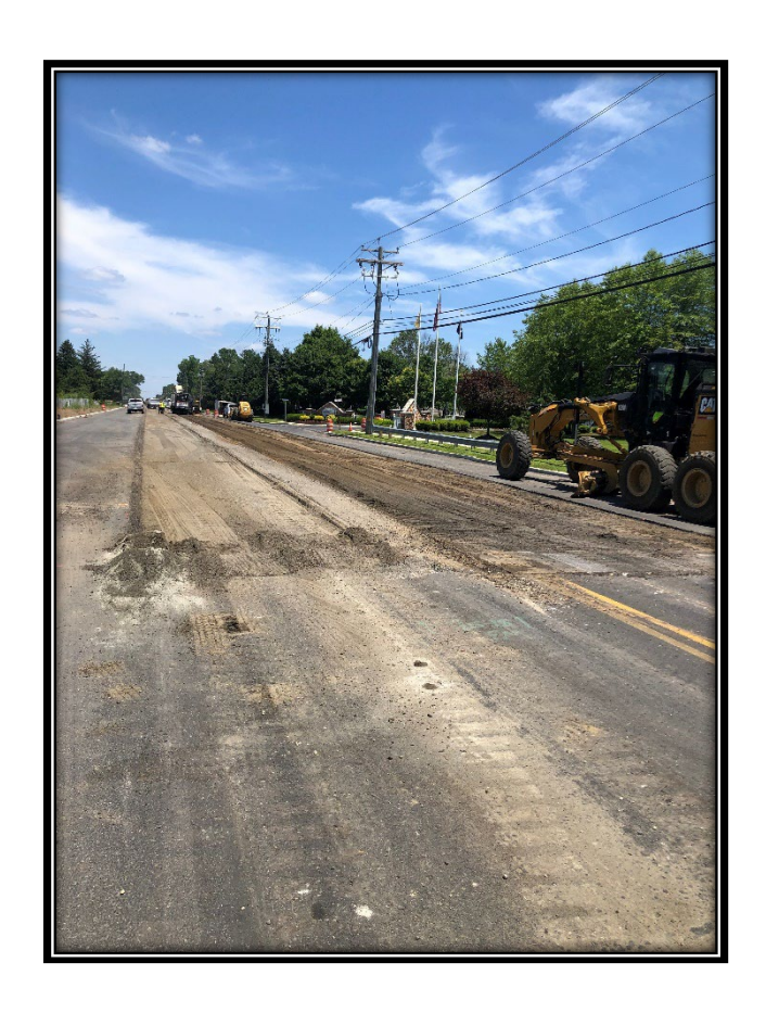
Figure: I Full depth pavement reclaimation from Madison to Franklin.

Progress Report #56 Monday, June 17, 2024 to Friday, June 28, 2024