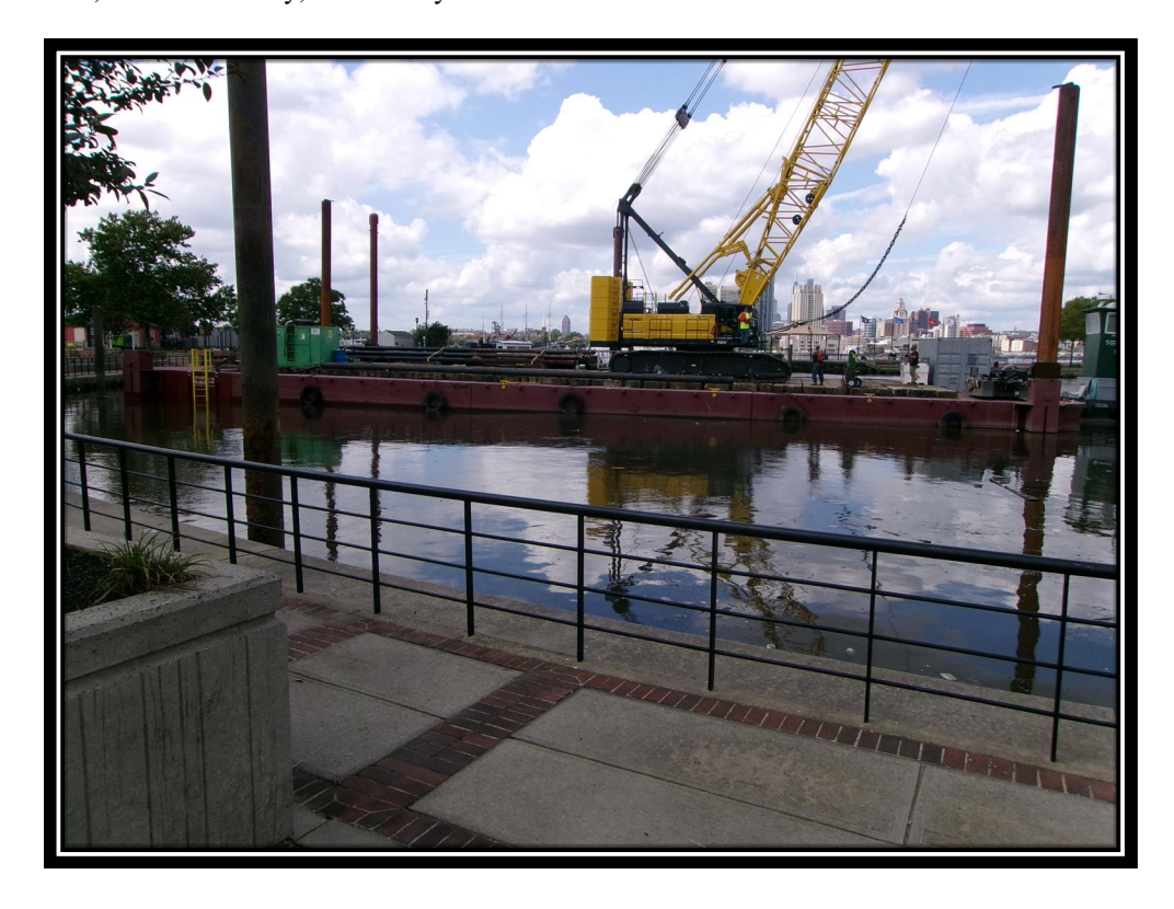
Figure: 2 – Barge and Crane for removal of existing piles