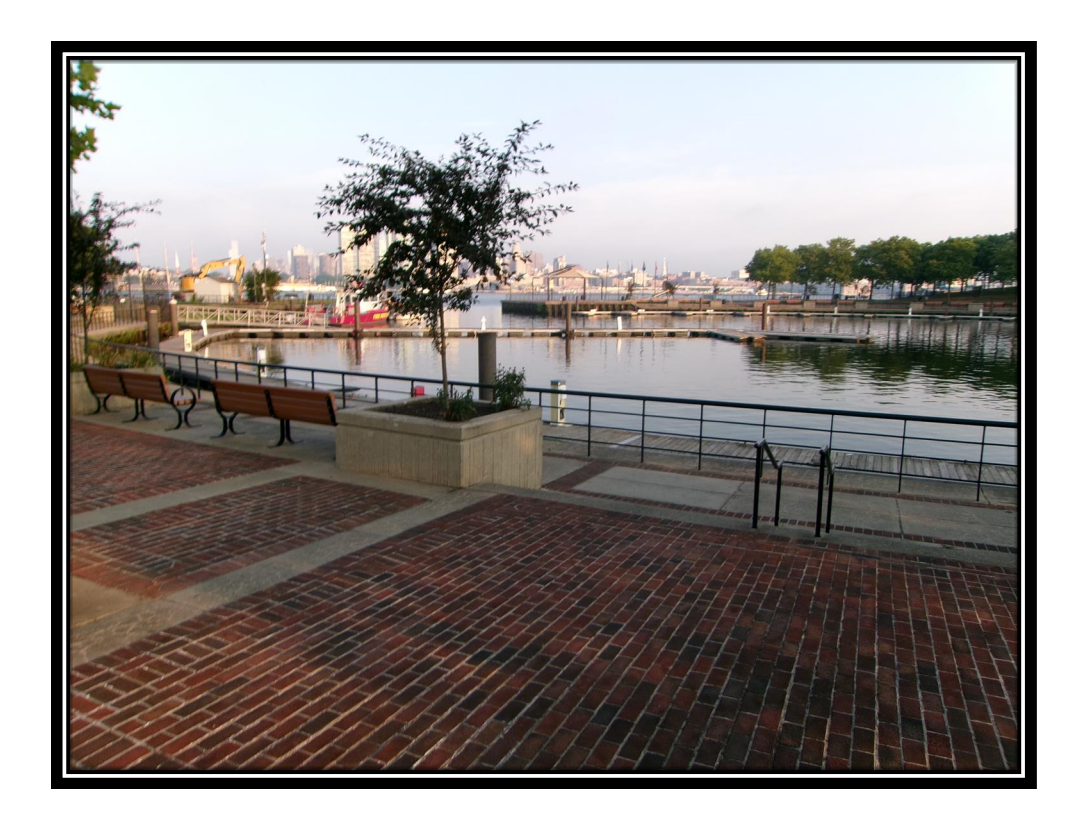
Figure: 3 – Marina after South State removed all of the existing piles as necessary