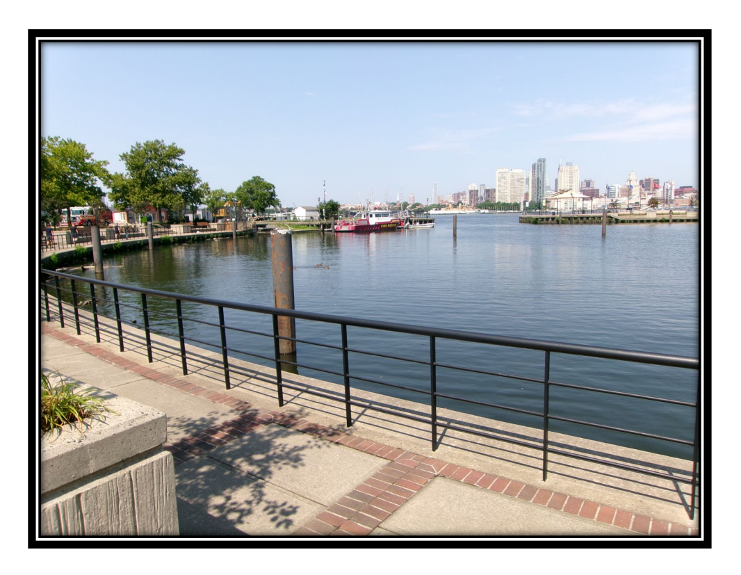
Figure: 3 – Marina after South State removed all of the existing piers and docks