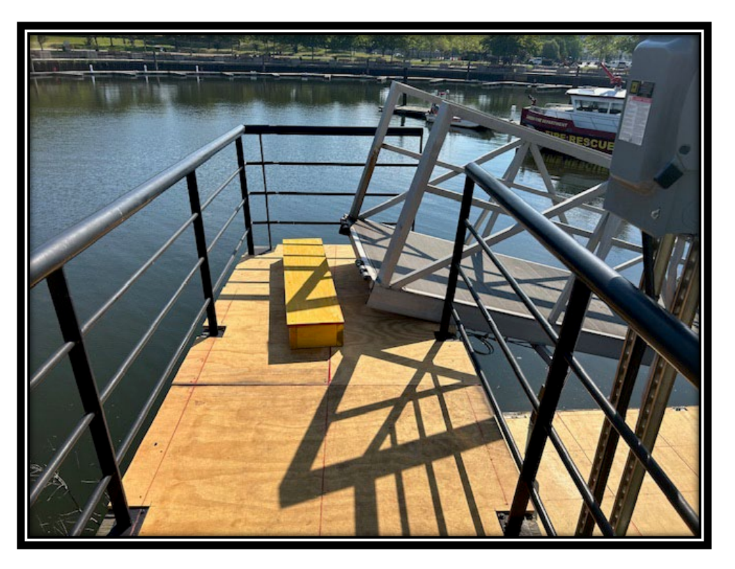
Figure: 2 – Temporary repair of fire dock and gangway