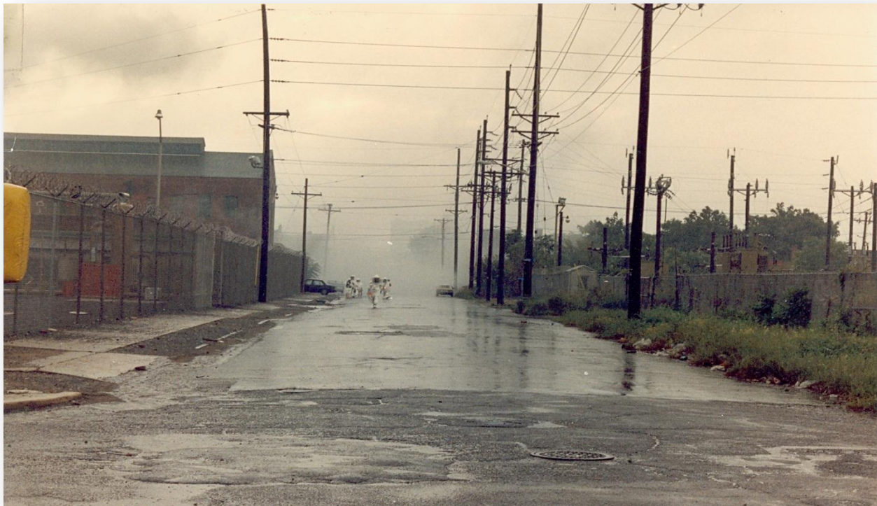
Response to a Plastic Chemical Fire in Camden County