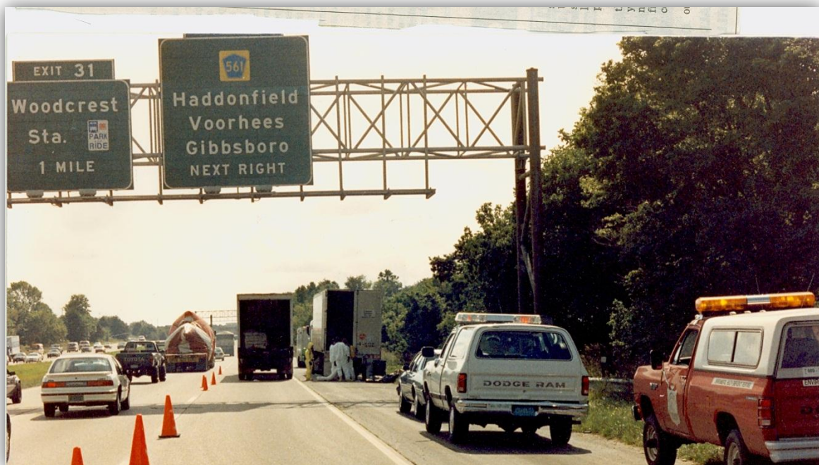
Stabilizing leaking containers in a box truck.