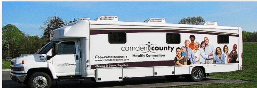
The “Camden County Health Connection” Mobile Health Unit

Support groups such as the Chronic Disease Self-Management Program, tobacco treatment and counseling, health seminars and skills-building workshops are also conducted upon request.